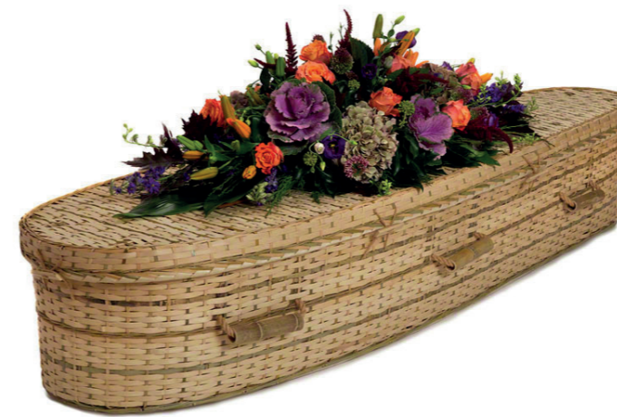
THE TEARDROP BAMBOO COFFIN