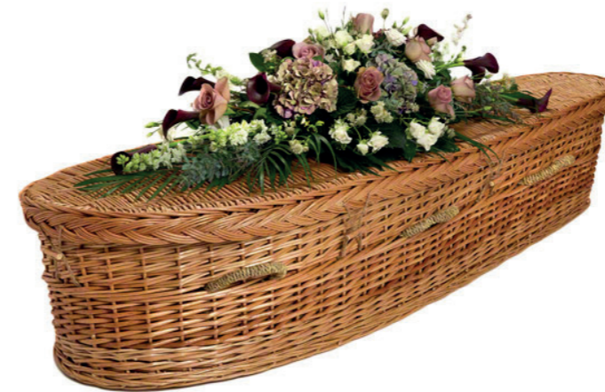
THE TEARDROP WILLOW COFFIN